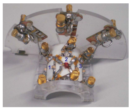
Fig. 2: 3-Channel receive array. The balun in the input circuit is mounted on the vertical plate.